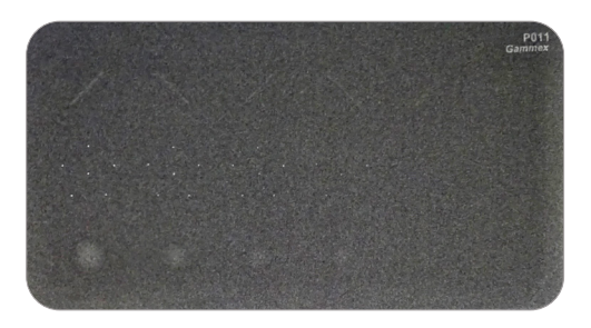
Mammo FFDM Phantom Wax Insert

The Mammo FFDM Phantom simulates radiographic characteristics of compressed breast tissue, including micro-calcifications, ductal fibrous structures and tumor-like masses. Identification of these small structures is essential to the early detection of breast cancer.